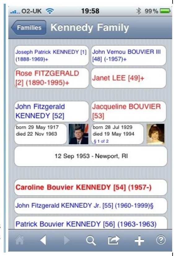
Families App for Legacy Family Tree Files

TelGen Limited Families —Works with Legacy Family Tree. You can sync your database from your computer to your device and back. I use this one. There is a webinar on the Legacy Family Tree website that walks you through how to install the app, sync your database and use the app. This works with iPhone, iPad, iPod Touch, Android Phone, Kindle Fire or Nook. Cost is $15.99.